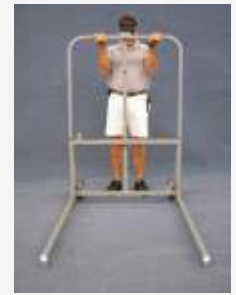
Insert M-Shaped part into the 3 slots. Adjust all levelers so they touch floor.