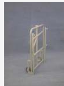
Trapeze shown in most compact configuration