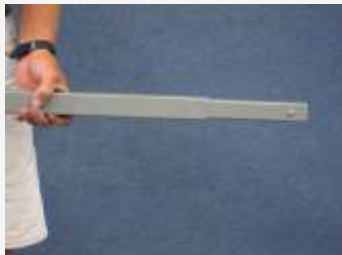
Align button on each leg and insert into top opening.