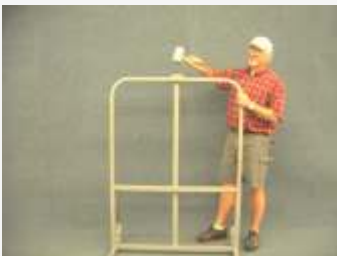
Use rubber mallet to tap down until it bottoms out.