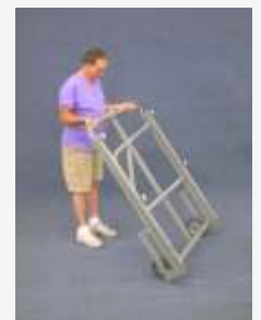
Easiest configuration for transporting from room to room.