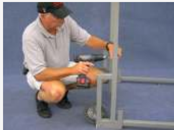
Using drill and socket cap screw provided, screw in the 4 self tapping screws.