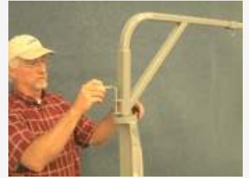
You can change positions of the boom by lifting pin