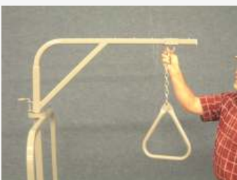
Unscrew the Quick-Link and hook over the Boom slider, then screw Quick-link closed