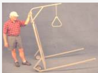
Trapeze is designed to tilt and roll. It is recommended to re- move the boom prior to moving.