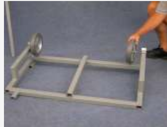
Lay base down as pictured and bolt on both wheels securely.