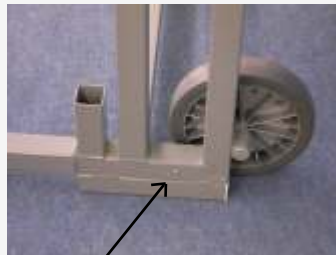
Make sure button secures in place.