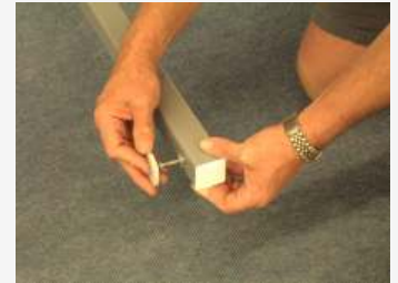
Screw each leveler all the way in. Do not over tighten.