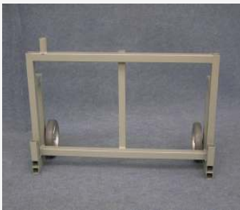
Set base in upright position.