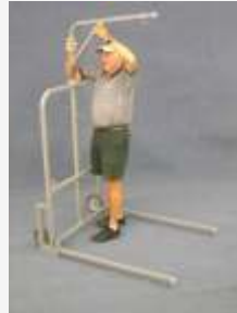
Insert Boom into slot on top of the M-Shaped piece. Make sure it bottoms out.