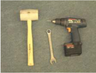
Tools needed: Rubber Mallet 3/4" Wrench & Drill